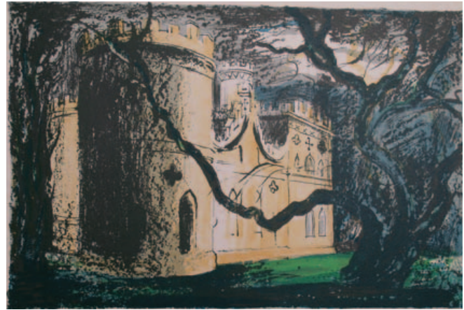
John Piper, Clytha Castle , Cat. no. 38