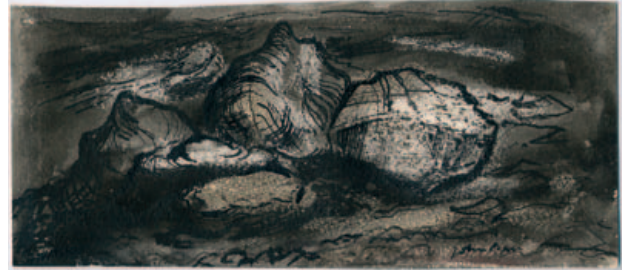
Cat. no. 29