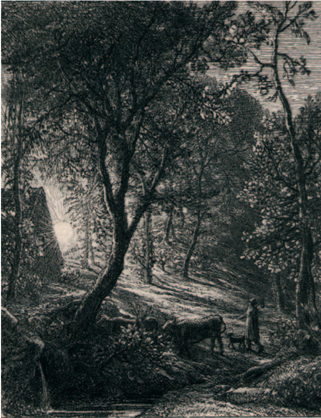
Samuel Palmer, The Herdsman's Cottage (Sunset) , Cat. no. 4