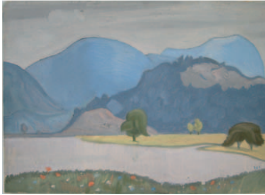
Mountain Landscape with a Lake, Cat. no. 41