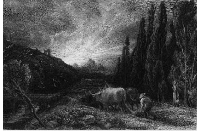
Cat. no. 9