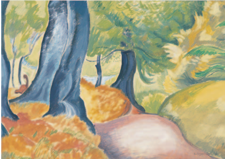
The Road to Woldingham, Cat. no. 43