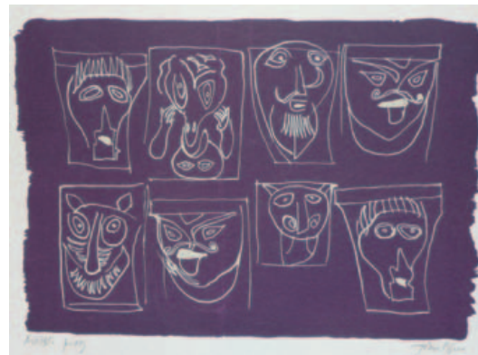
Cat. no. 37