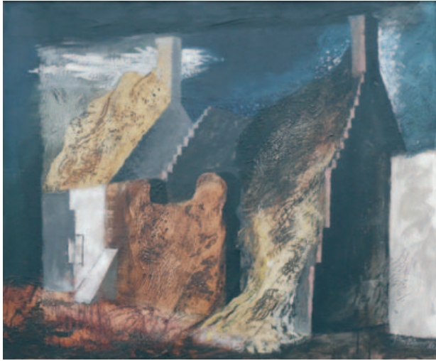
Cat. no. 16