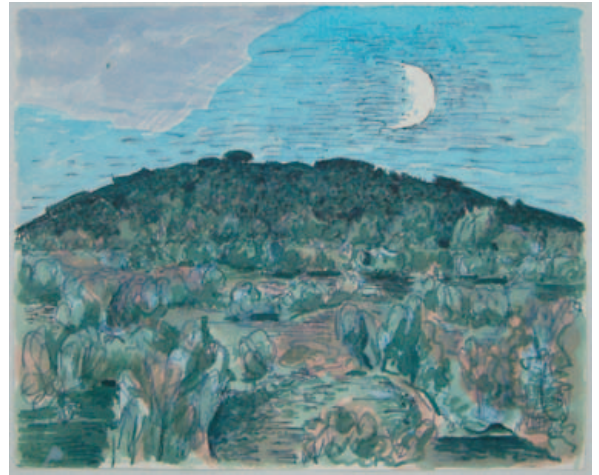
Dark Hill and Moon, Cat. no. 50